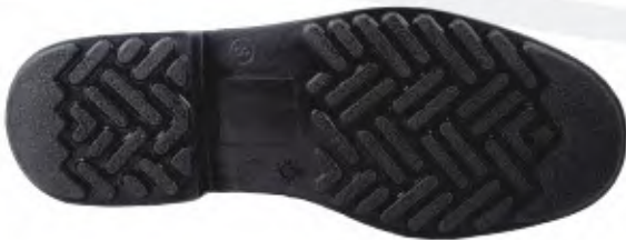
Light weight Single Density PU sole