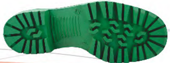
Large and comfortable. Aggressive look. Ideal for industrial floors and tough environments. Acid, Alkali and Chemical resistant. Electrical Insulative Available in green and black soles.