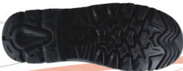
PU sole for Lady feeting.