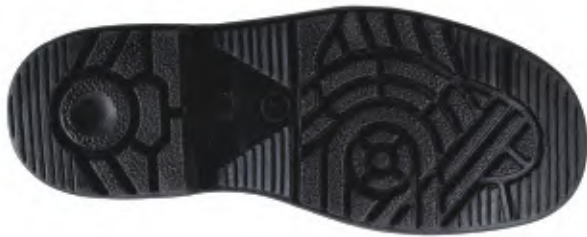
Light weight Single Density PU sole