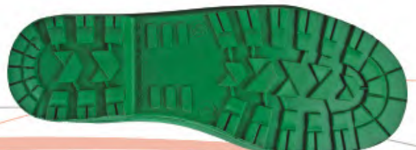
Light weight and flexible. Ride on Technology.